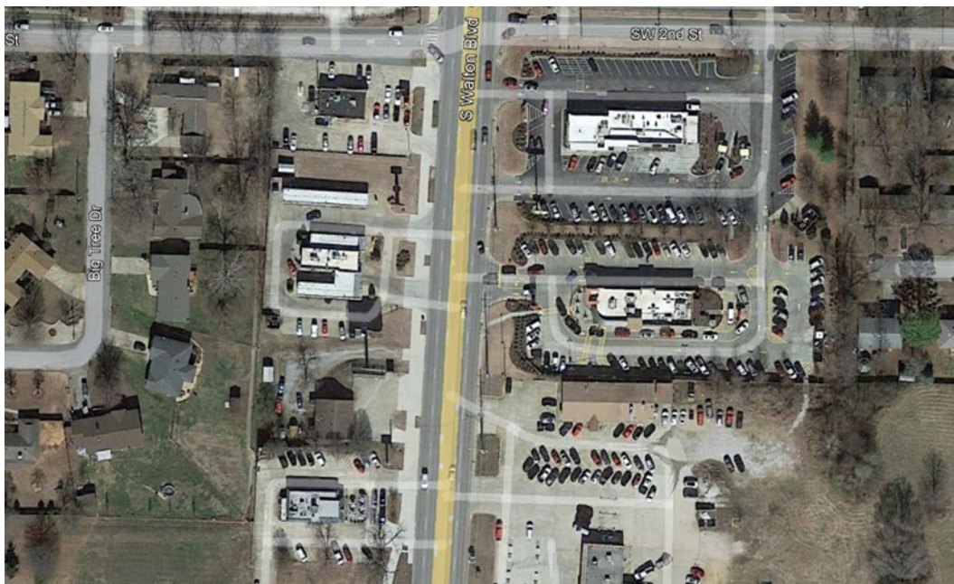
Figure 6: North Walton Boulevard Trail

This section of trail reviewed along North Walton Boulevard is approximately a 1.48-mile segment extending from NW 14th Street (Walton Boulevard) to SW I Street in Bentonville, AR. This trail was constructed in approximately year 2015 based on Google Earth aerial photography. Existing Annual Average Daily Traffic (AADT) volumes were obtained from the 2019 Arkansas Department of Transportation (ARDOT) Average Daily Traffic online application. The AADT along this segment of North Walton Boulevard varies between 25,000 and 30,000 as there are two AADT count locations. Crash data was collected using the ARDOT Arkansas Crash Analytics Tool (ACAT) online application. Due to the limitations of the ACAT online application, total crashes along the segment were not collected and only Bicycle/Pedestrian crashes were collected. Over the five-year period, one (1) Bike/Ped crash occurred along this segment of North Walton Boulevard which results in a crash rate of less than one (1) Bike/Ped crash per mile by year. No injuries or fatalities were observed in the Bike/Ped crash data along the segment. An aerial image from the trail along North Walton Boulevard is shown below in Figure 6 .