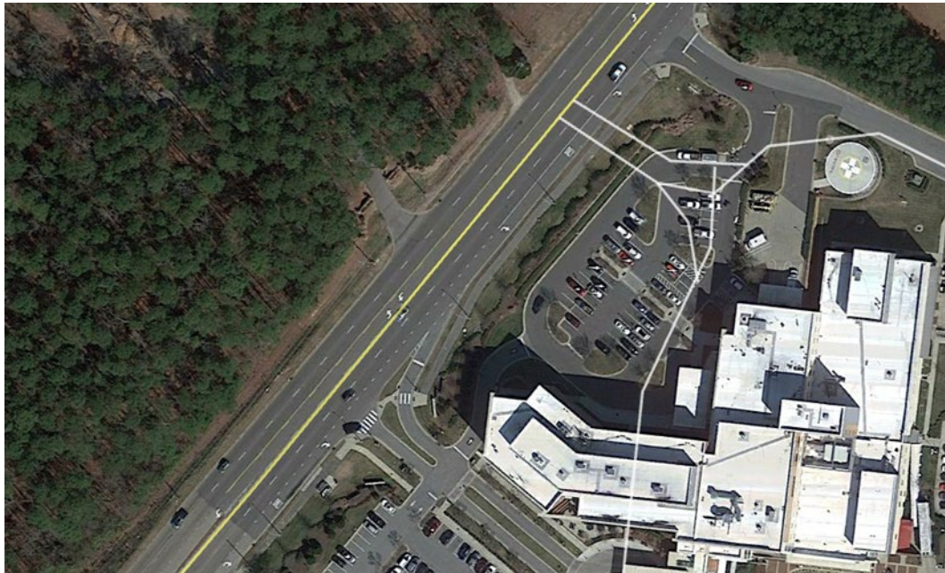
Figure 7: Falls of Neuse Road Trail

This section of trail along Falls of Neuse Road reviewed for this effort is approximately a 3.13-mile segment extending from Falls Valley Drive to Old Falls of Neuse Road in Raleigh, NC. This trail was constructed in approximately year 2005 based on Google Earth aerial photography. Existing Annual Average Daily Traffic (AADT) volumes were obtained from the 2019 North Carolina Department of Transportation (NCDOT) Annual Average Daily Traffic Mapping Application. The AADT along this segment of Falls of Neuse Road varies between 39,000 and 50,500 as there are four AADT count locations. Crash data was collected using the NCDOT Planning Level Safety Scoring Data interactive web application. Over the five-year period, a total of 726 crashes occurred along this segment of Falls of Neuse Road. The crash rate resulting from the 726 crashes occurring over the five-year period and the 3.13-mile segment is 47 crashes per mile by year. Of those 726 crashes, ten (10) involved a bicycle or a pedestrian which gives a crash rate of less than one (1) Bike/Ped crash per mile by year. The crash data obtained from NCDOT did not indicate severity of the injury or whether a fatality occurred for bicycle and pedestrian crashes. An aerial image from the Falls of Neuse Road Trail is shown below in Figure 7 .