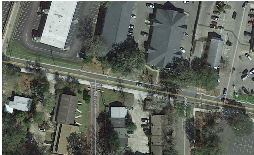
Figure 1: Lafayette Street Trail

The section of multi-use path reviewed along Lafayette Street is approximately a 0.89-mile segment extending from Franklin Boulevard to Magnolia Drive in Tallahassee, FL. The trail was constructed approximately in year 2012. The AADT along this segment of Lafayette Street is 9,300. Over the five-year period, a total of 210 crashes occurred along the studied segment. The crash rate resulting from the 210 crashes occurring over the five-year period and the 0.89-mile segment is 48 crashes per mile per year. Of those 210 crashes, three (3) involved a bicycle or a pedestrian which gives a crash rate of less than one (1) Bike/Ped crash per mile per year. In addition, over the five-year period, the three (3) Bike/Ped crashes resulted in injury and there were no fatalities. An aerial image of the Lafayette Street Trail is shown below in Figure 1 .