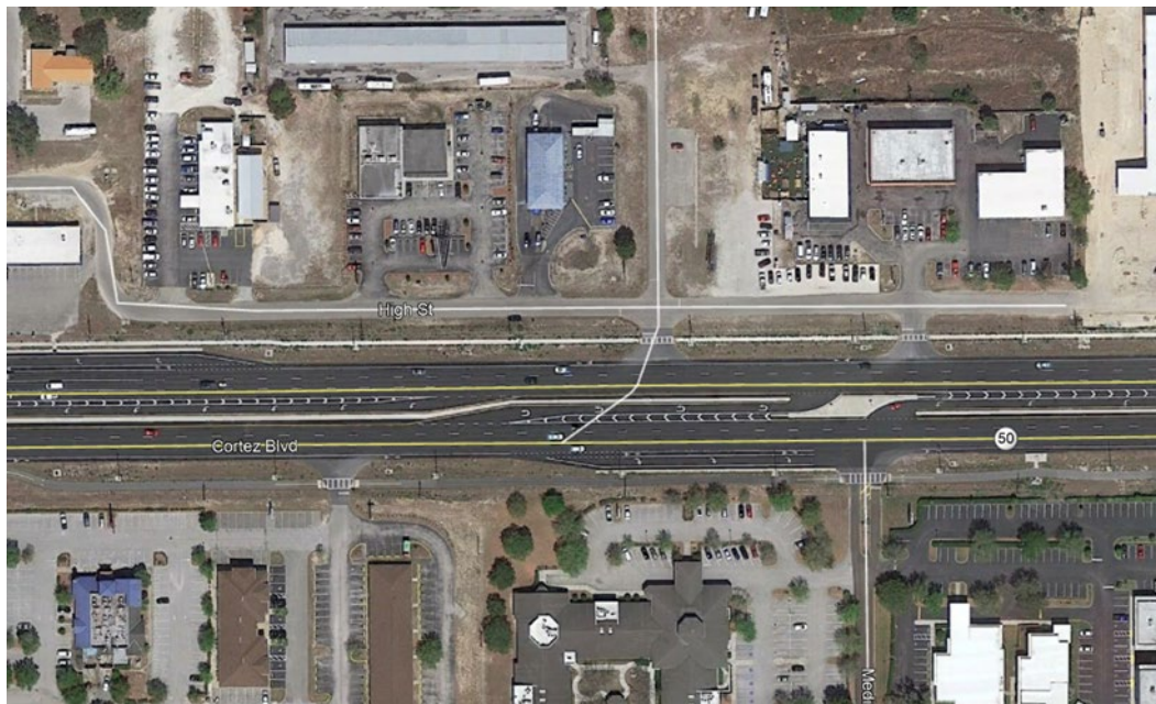
Figure 5: Cortez Boulevard Trail

This section of multi-use path reviewed along Cortez Boulevard is approximately a 5.84-mile segment extending from US 19 to Suncoast Parkway in Spring Hill, FL. This path was constructed approximately in year 2014 based on Google Earth aerial photography. The AADT along this segment of Cortez Boulevard varies between 27,500 and 40,500 as there are four AADT count locations. Over the five-year period, a total of 1,513 crashes occurred along this segment of Cortez Boulevard. The crash rate resulting from the 1,513 crashes occurring over the five-year period and the 5.84-mile segment is 52 crashes per mile by year. Of those 1,513 crashes, 18 involved a bicycle or a pedestrian which gives a crash rate of less than one (1) Bike/Ped crash per mile by year. In addition, over the five-year period, 16 of the Bike/Ped crashes resulted in injury and there were two (2) fatalities. An aerial image from the Cortez Boulevard Trail is shown below in Figure 5 .