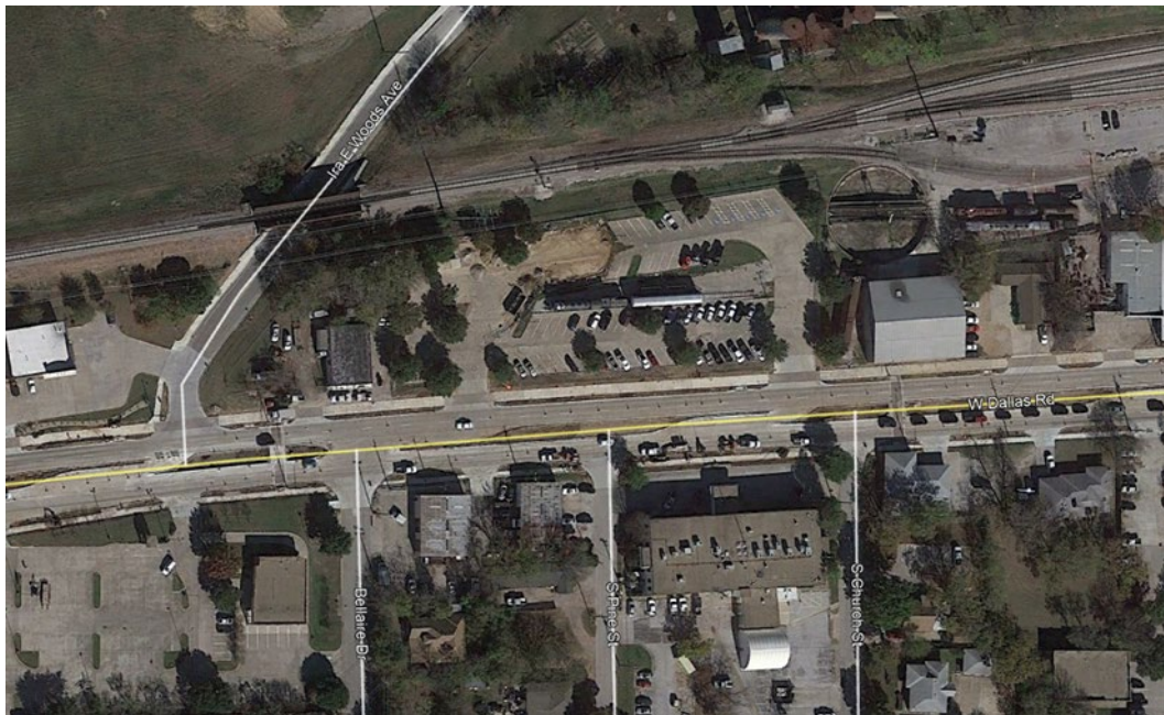
Figure 8: Dallas Road Trail

This section of trail reviewed along Dallas Road is approximately a 0.34-mile segment extending from Ball Street to Main Street in Dallas, TX. This Trail was constructed approximately in year 2020 based on Google aerial photography. Existing Annual Average Daily Traffic (AADT) volumes were obtained from the 2020 Texas Department of Transportation (TxDOT) District Traffic Web Viewer online application. The AADT along this segment of Dallas Road is 25,927. Crash data was collected using the TxDOT Crash Record Information System (CRIS) Query online application. Over the five-year period, a total of 192 crashes occurred along this segment of Dallas Road. The crash rate resulting from the 192 crashes occurring over the five-year period and the 0.34-mile segment is 113 crashes per mile by year. Of those 192 crashes, four (4) involved a bicycle or a pedestrian which gives a crash rate of two (2) Bike/Ped crashes per mile by year. In addition, over the five-year period, two (2) of the Bike/Ped crashes resulted in injury and there were no fatalities. An aerial image from the Dallas Road Trail is shown below in Figure 8 .