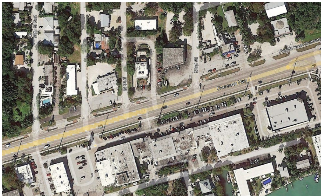
Figure 3: Overseas Trail

This section of the Overseas Trail along US 1 reviewed for this effort is approximately a 5.72-mile segment extending from Knights Key Boulevard to Gulf of Mexico Boulevard in Marathon, FL. This trail was constructed sometime prior to year 2000 based on Google Earth aerial photography. The AADT along this segment of US 1 varies between 12,800 and 29,900 as there are four AADT count locations. Over the five-year period, a total of 997 crashes occurred along this segment of US 1. The crash rate resulting from the 997 crashes occurring over the five-year period and the 5.72-mile segment is 35 crashes per mile per year. Of those 997 crashes, 49 involved a bicycle or a pedestrian which gives a crash rate of 2 Bike/Ped crashes per mile per year. In addition, over the five-year period, 37 of the Bike/Ped crashes resulted in injury and there were four (4) fatalities. An aerial image of the Overseas Trail is shown below in Figure 3 .