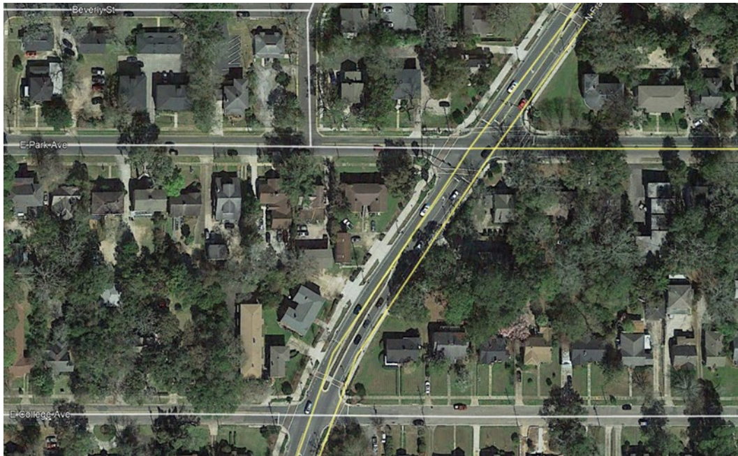
Figure 2: Franklin Boulevard Trail

The section of multi-use path reviewed along Franklin Boulevard is approximately a 0.54-mile segment extending from Mahan Drive to Lafayette Street in Tallahassee, FL. This trail was constructed approximately in year 2013. The AADT along this segment of Franklin Boulevard is 8,700. Over the five-year period, a total of 156 crashes occurred along the studied segment of Franklin Boulevard. The crash rate resulting from the 156 crashes occurring over the five-year period and the 0.54-mile segment is 58 crashes per mile per year. Of those 156 crashes, three (3) involved a bicycle or a pedestrian which gives a crash rate of 2 Bike/Ped crashes per mile per year. In addition, over the five-year period, all seven (7) of the Bike/Ped crashes resulted in injury and there were no fatalities. An aerial image of the Franklin Boulevard Trail is shown below in Figure 2 .