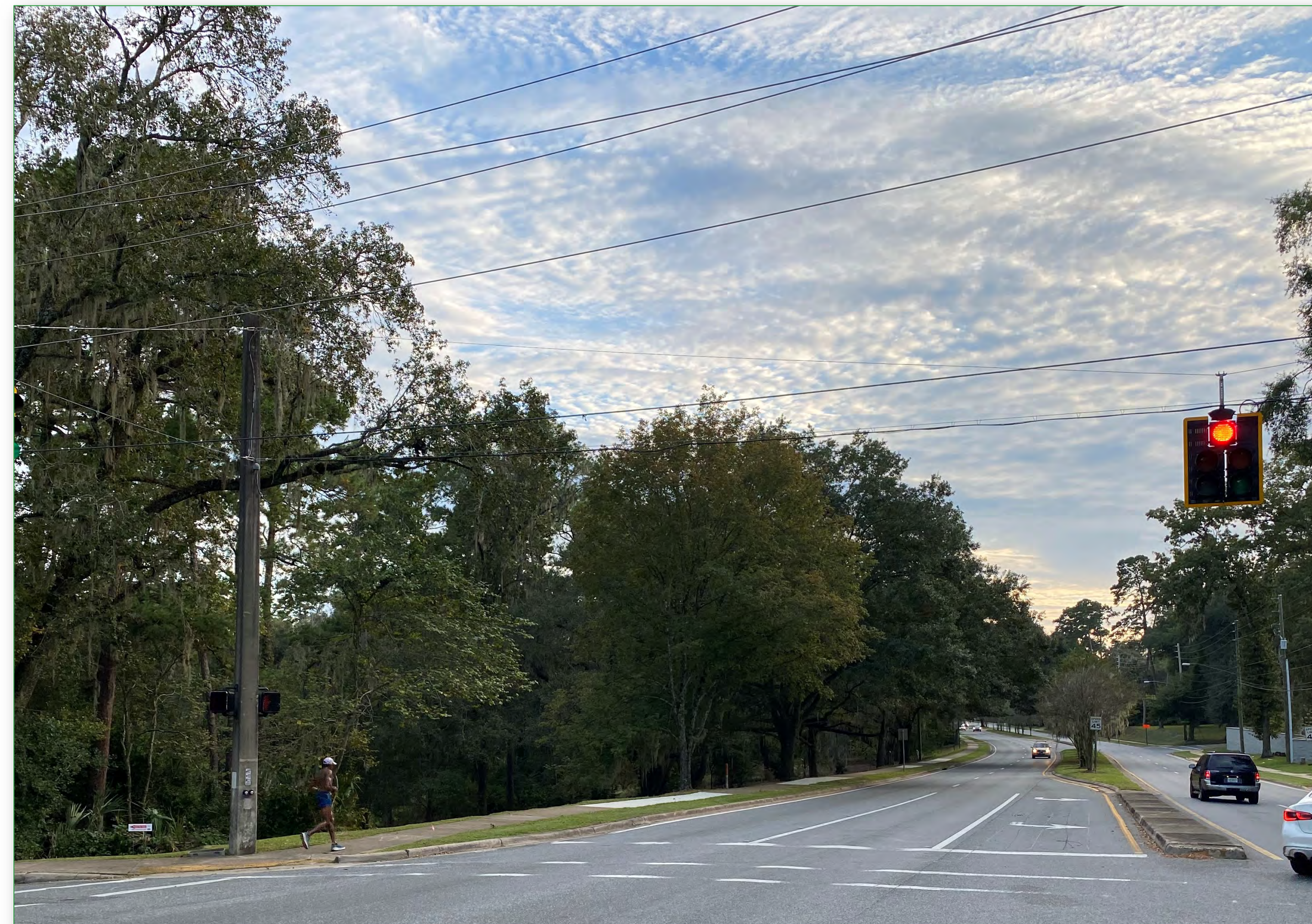
Intersection of Thomasville Road and Armistead Road