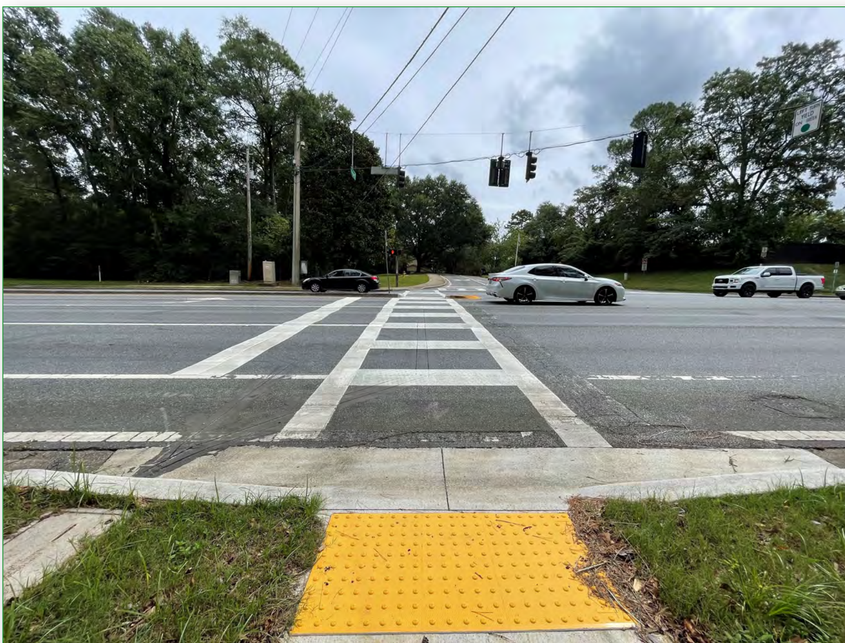
Existing crossing on north side of Woodgate Way and Thomasville Road Intersection

The project team assessed segments 2 and 3 for an opportunity to place a crossing along the corridor. Both Hermitage Boulevard and Woodgate Way were evaluated. The table below includes information about these two intersections: