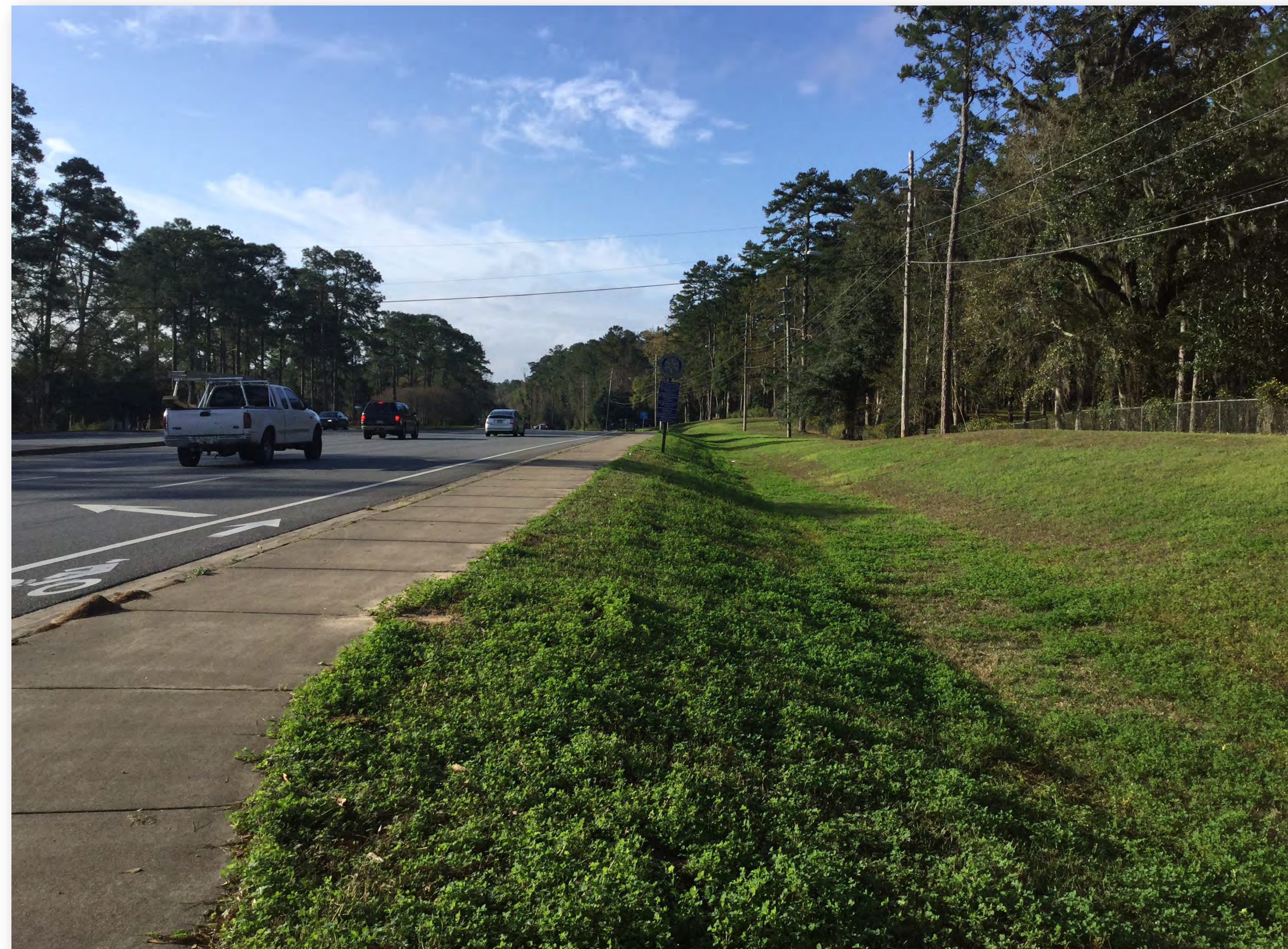
Thomasville Road West south of Live Oak Plantation Road