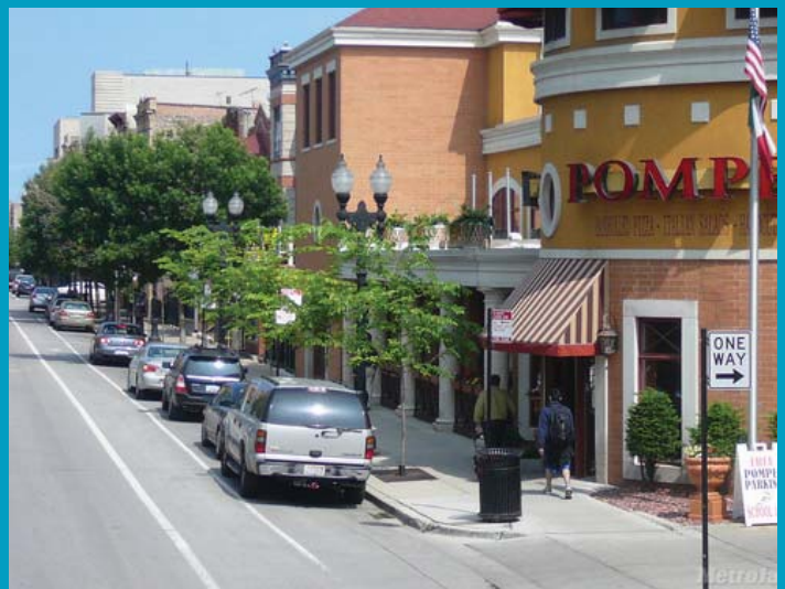
TRANSIT ORIENTED DEVELOPMENT