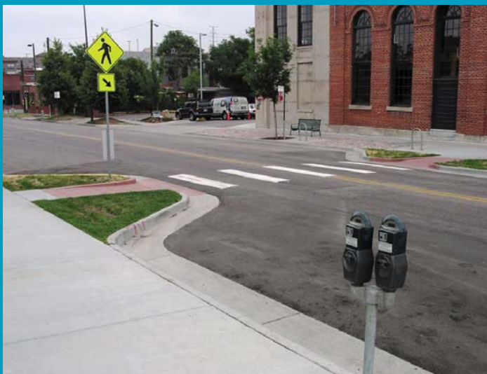
PEDESTRIAN CIRCULATION TREATMENT