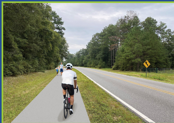
A multi-use trail shown on Iron Bridge Road