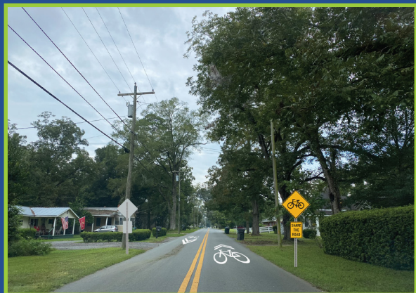
Sharrows and signage along 9th Avenue E