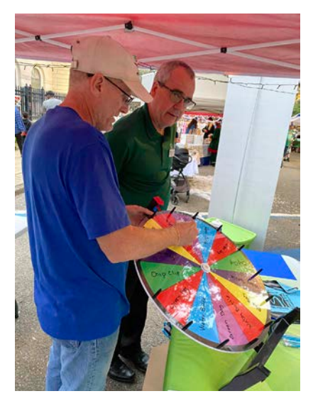
Spinning wheel for pop-up events.