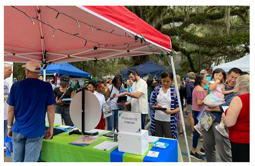
Pop-up event at Tallahassee Winter Festival in December 2022.