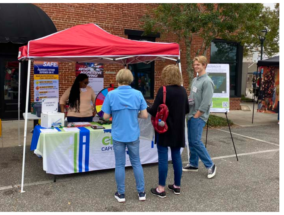
Pop-up event at Havana Winterfest in December 2022.