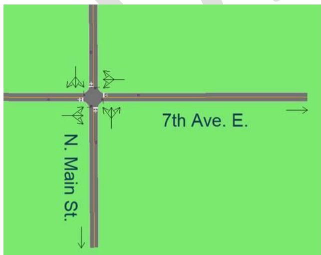
Figure 3. Build Alternative

The analysis was conducted using Synchro 10 to determine how the facility would function as a two-lane roadway with on street parking and if dedicated left turn lanes were warranted at 7 th Avenue and US 27/Main Street. The analysis was based on the PM peak hour traffic collected on December 14 th , again reflecting the highest traffic. The build configuration of two lanes in each direction from the analysis is shown in Figure 3.