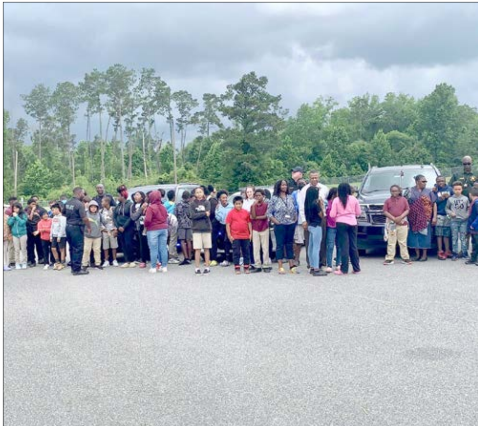
Local law enforcement agencies participate in a county-wide law enforcement parade, visiting local elementary schools.