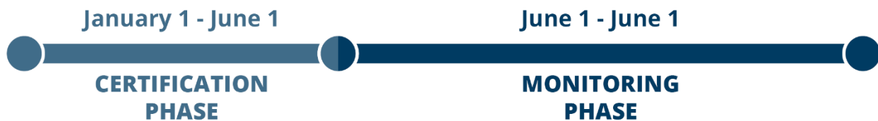
Figure 1. Risk Assessment Process

Figure 1 shows the risk assessment and monitoring timeline.