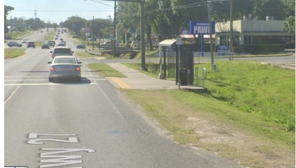
N. Monroe Street Corridor (west side)