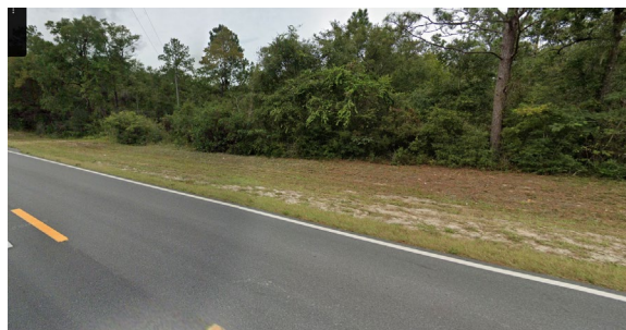
Dr. MLK, Jr. Memorial Drive