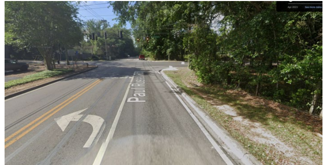
Paul Russell Road Corridor