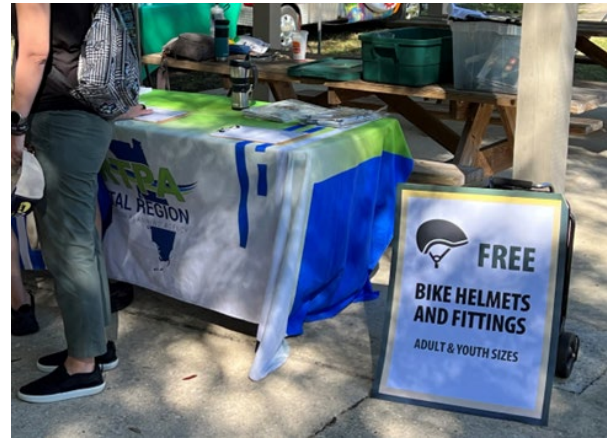
Photographs of the First Days Bikes event*

The First Days Bikes event was a cycling-focused effort coordinated by the Office of Greenways and Trails and provided an outdoor expo featuring educational booths, local food trucks, and, as noted above, free bike helmets.